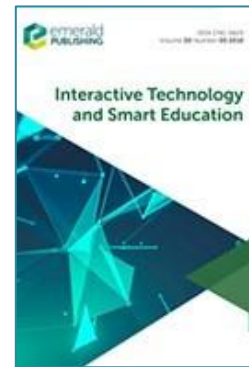
Interactive Technology and Smart Education (ESCI and Scopus listed)