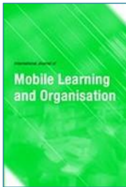
International Journal of Mobile Learning and Organisation (Scopus listed)

Special issues of high-quality journals will be devoted to selected papers of the Conference. The journals include International Journal of Mobile Learning and Organisation (ESCI and Scopus listed) and Interactive Technology and Smart Education (ESCI and Scopus listed). Extended versions of conference papers are being invited for review and publication in the journals.